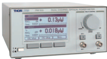
NEW PM300 Dual Channel Power Meter