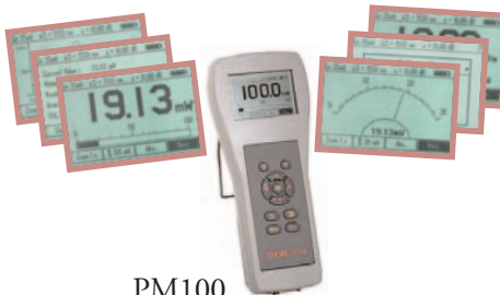
PM100 Hand held Power Meters