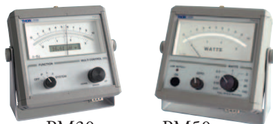
PM30 PM50 Analog/Digital Power Meters