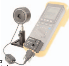
PM10 Field Power Meter Module