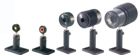
Semiconductor & Thermal Power Meter Heads