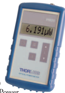
PM20 Fiber Power Meters